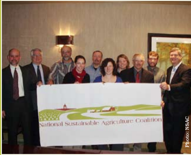
NSAC “Iowa delegation” meets with Secretary Vilsack during NSAC’s inaugural meeting in March 2009.