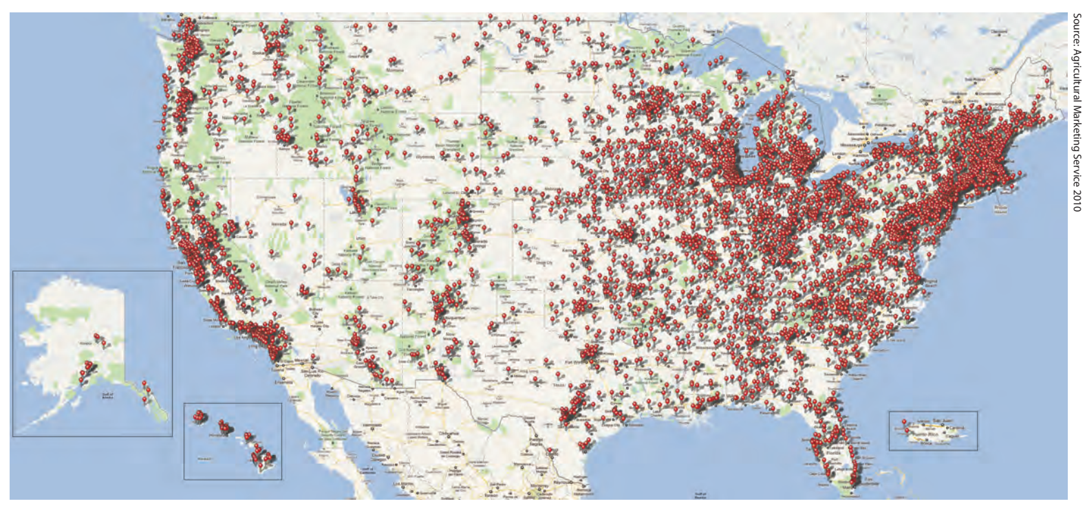
This map shows the distribution of thousands of farmers markets across the country, in all 50 states and the District of Columbia.

producers, thereby helping to foster competition in markets that have experienced significant consolidation in recent decades. Overall, the expansion of local and regional food systems could complement the nation's existing mechanisms for food production, distribution, and consumption. Greater investment in local and regional food systems would thus be an essential step for agriculture policies that seek to support such economic activity.