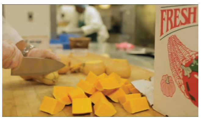
Common Market - Squash, USDA*

grassrootsguide/local-food-systems-ruraldevelopment/local-food-enterprise-loans/