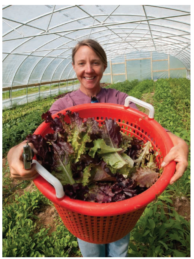
Fall Line Farms Cooperative; Richmond, VA, Lance Cheung, USDA*

This program provides competitive grant funding to projects that market directly to consumers and to local and regional food business enterprises that aggregate, process, and distribute food products to meet market demand. Priority is given to projects serving low-income/low food access communities. For more information, please visit: www.sustainableagriculture.net/publications/ grassrootsguide/local-food-systems-ruraldevelopment/farmers-market-promotion-program/